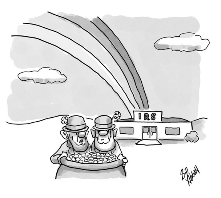
"Well, that's out. What about the Cayman Islands?"